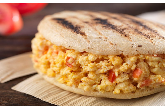
Above: Some of the foods they eat in Venezuela